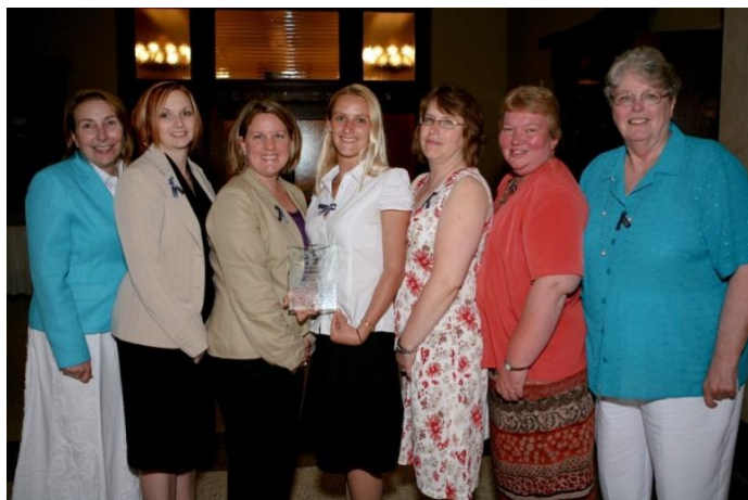
Haldimand-Norfolk Community Senior Support Services Inc.

In spite of the many challenges of serving a vast rural area, and delivering services with limited resources, the organization has maintained its commitment to serving the needs of a growing senior population.