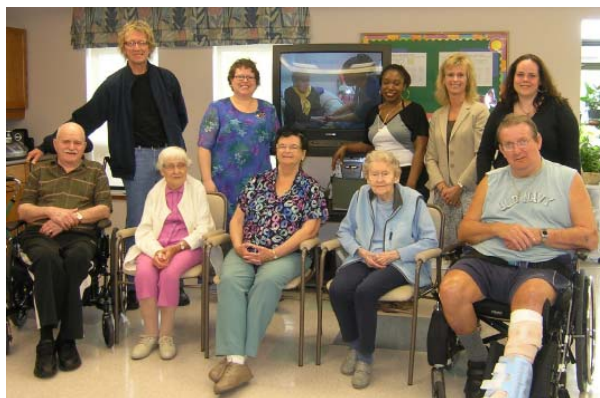
Village of Wentworth Heights Staff and Residents from Oral Care DVD celebrating its RNAO launch, Hamilton